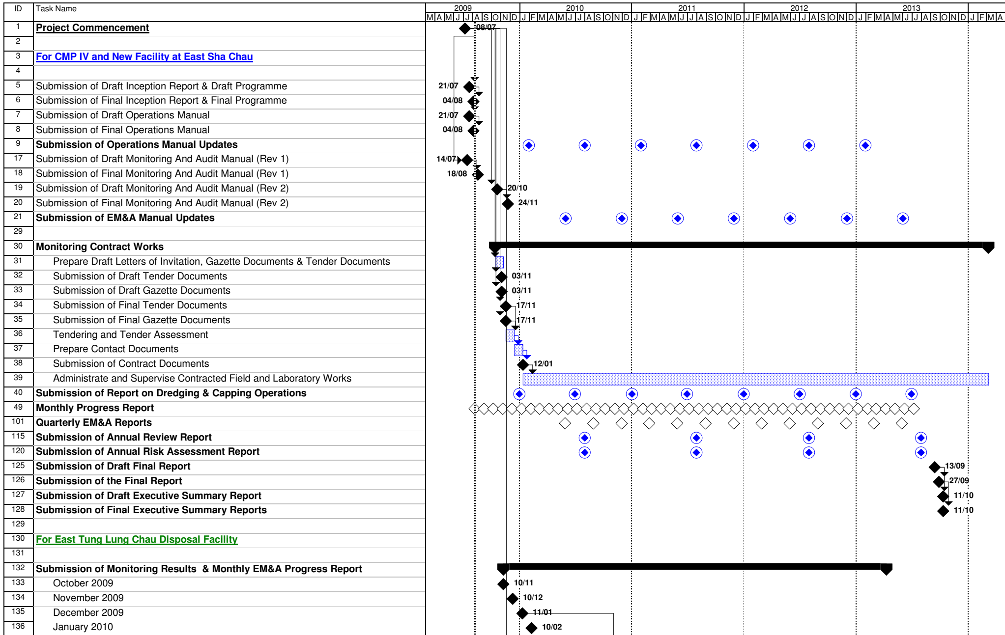
Figure 4.1 - Study Programme